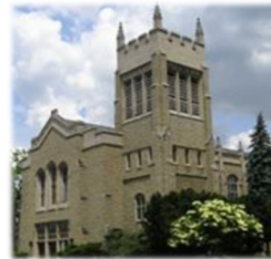
Yorkminster Park Baptist Church in Toronto.

This month, we are praying for the people of: